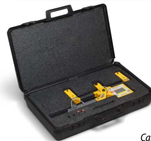
Carry case included

Dillon also manufactures highly accurate electronic and mechanical dynamometers and crane scales.